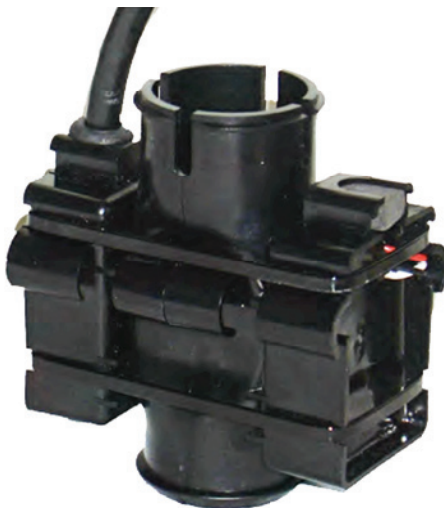
Loup Population Sensor