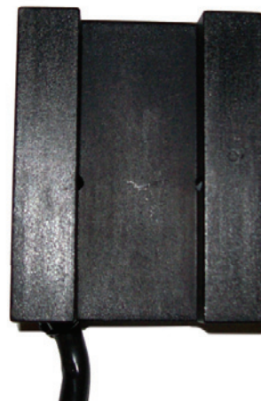
Hopper Level Sensor