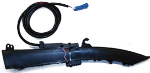
Smart Planter Sensors