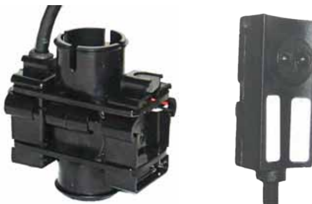
Loup Population Sensor & Blockage Sensor