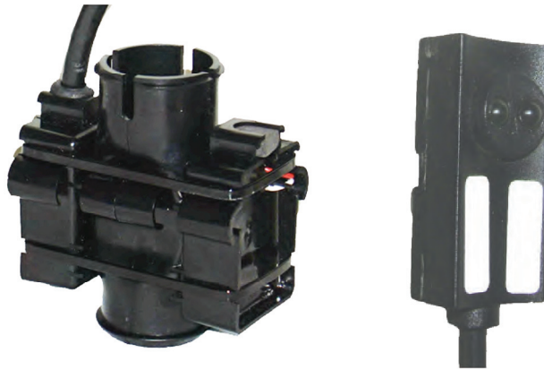
Loupe Population Sensor & Blockage Sensor