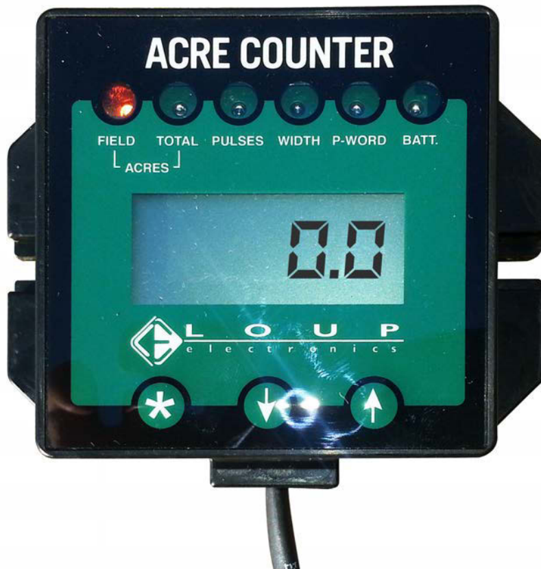
Field Acres, Total Acres, Pulses per 400 ft, Width, Password and Low Battery

The battery operated acre counter operates in one of two modes. In sleep mode, the display is blank, and the counter is accumulating acres. Sleep mode will be entered if a button is not pressed for 20 seconds. In entry mode, the display is on, and the operator can enter values. To get into entry mode, press the *(STAR) button. If you continue to press the *(STAR) button, the acre counter will cycle through the functions that it can perform. The LEDs above the display indicate which function is selected. The available functions are: