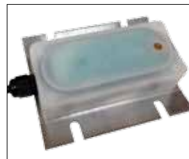
RD Moisture Sensor

Unlike the Elevator side mount where the readings from the crop harvested may be delayed by seconds or even minutes, the Loup Electronics RD Sensor will give instantaneous readings all the time.