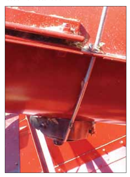
Case FG Installation