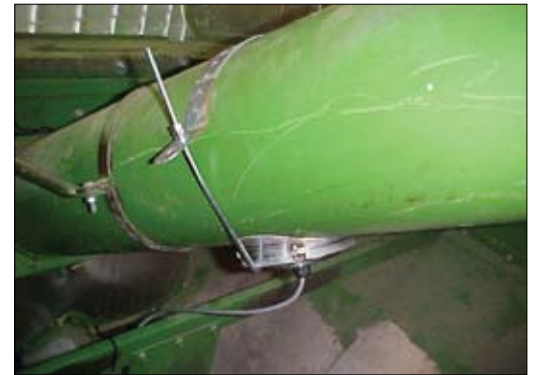
John Deere FG Installation