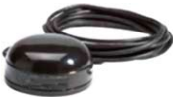
Garmin 16 GPS Receiver