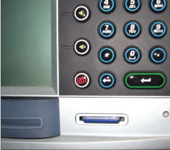
Yield Monitor SD Card Slot