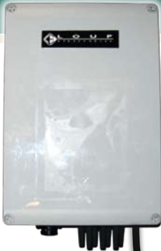
INCLUDED CRUIZER MODULE