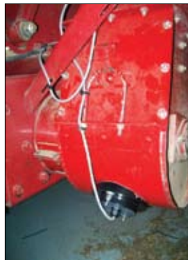
Case FG Installation