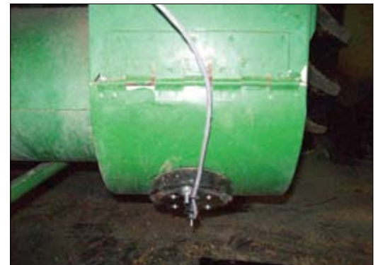
John Deere FG Installation