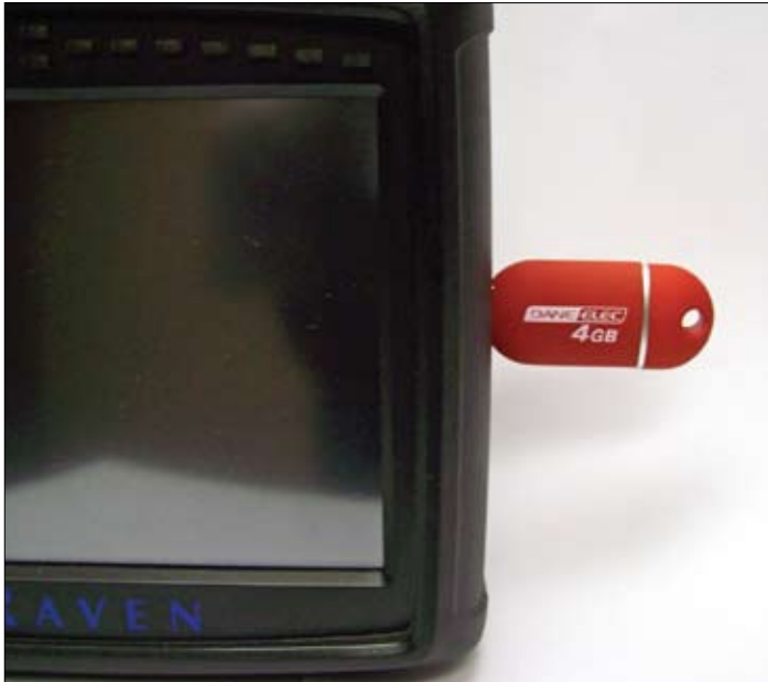
USB Drive Slot